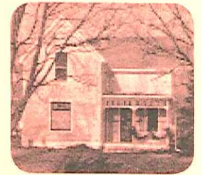
512 Church Street, rehabilitated