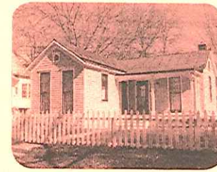
412 Church Street, rehabilitated

Friends has supported the move and restoration of the Wetherby Cottage as well as the rehabilitation of a number of historic structures in Iowa City. Year round, Friends operates the Salvage Barn of architectural and historic building parts. The Barn provides a cost effective way for owners of older buildings to repair and restore structures in accordance with the Secretary of the Interior's Standards.