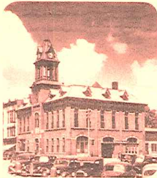
City Hall, Iowa City, razed 1961