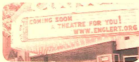
Englert Theatre, rehabilitated