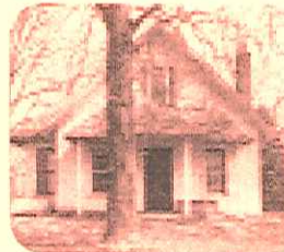
Bluffwood Cottage, lost