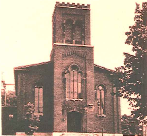
Old Brick, saved

In 2007, FHP was recognized by the national Trust for Historic Preservation with a national Preservation Honor Award for the massive recovery effort made to protect the historic fabric of the community after the 2006 Tornado. In years prior, Friends invested in the community with both volunteer labor and funds to restore Iowa City's Englert Theatre, purchased endangered homes in historic neighborhoods to restore and return to the community as single family residences, and many times stood with other citizens and groups to save endangered structures.