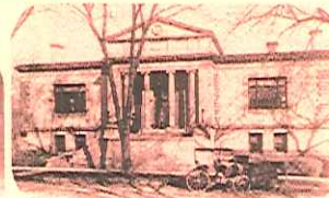
Carnegie Library, saved