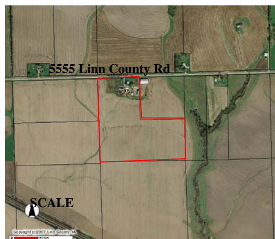
Figure 1 - Example Map